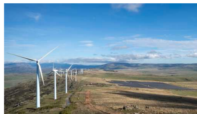
28.75 MW, Spain 28.75 MW, 西班牙

SolarNova项目是由新加坡政府主导的一项规划, 旨在加速在新加坡公共住房和公共部门建筑屋顶上部署光伏系统。葡电新能源(亚太) 获得了该规划中的3份招标, SolarNova 1 和 SolarNova 4 的总容量超过180 MWp。SolarNova 8 是整个规划中最大的项目, 预计将在1075座公共住宅建筑和101座政府拥有的建筑中实现高达 200 MWp的光伏发电能力。