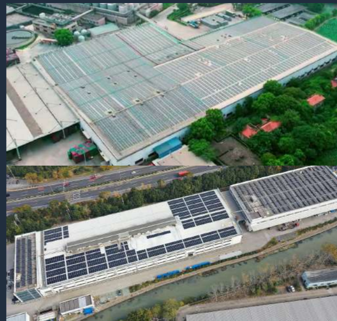
(Top) 22.3 MWp across Budweiser sites; (Bottom) 21.5 MWp across COFCO sites (上) 百威的五个地点总装机容量达 22.3 MWp, (下) 中粮集团的十个地点总装机容量达 21.5 MWp

百威的安装项目覆盖5个地点, 总容量为 22.3 MWp; 中粮集团的安装项目覆盖10个地点, 累计总容量为 21.5 MWp。