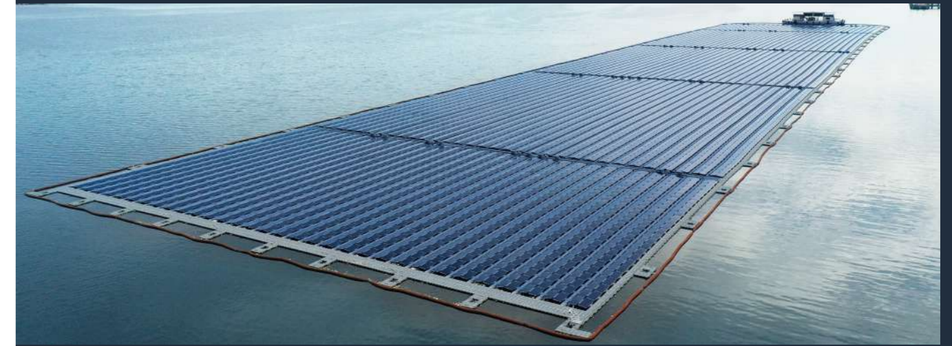
Offshore Floating Photovoltaic System, Singapore 离岸浮动光伏系统, 新加坡柔佛海峡

葡电新能源 (亚太) 是葡电新能源的全资子公司。公司总部位于新加坡，在该地区已装机与确定清洁能源容量超过 1.3 GWp。葡电新能源 (亚太) 的业务遍及澳大利亚、中国、日本、韩国和越南等9个区域市场。