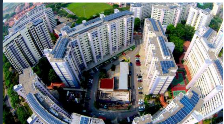
>180 MWp, Singapore >180MWp, 新加坡