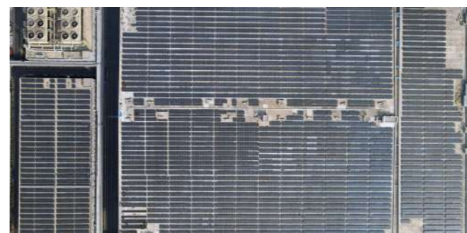
19 MWp, Anhui, China 19MWp, 中国安徽

Cruz de Hierro 是第一个在同一连接点结合风能和光伏的综合项目。第一阶段有 22 台风力涡轮机, 容量为 14.5 MW。第二阶段安装光伏板后, 总装机容量达到 28.75 MW。该项目每年产生的能源足以供应该地区 17,000 多个家庭。