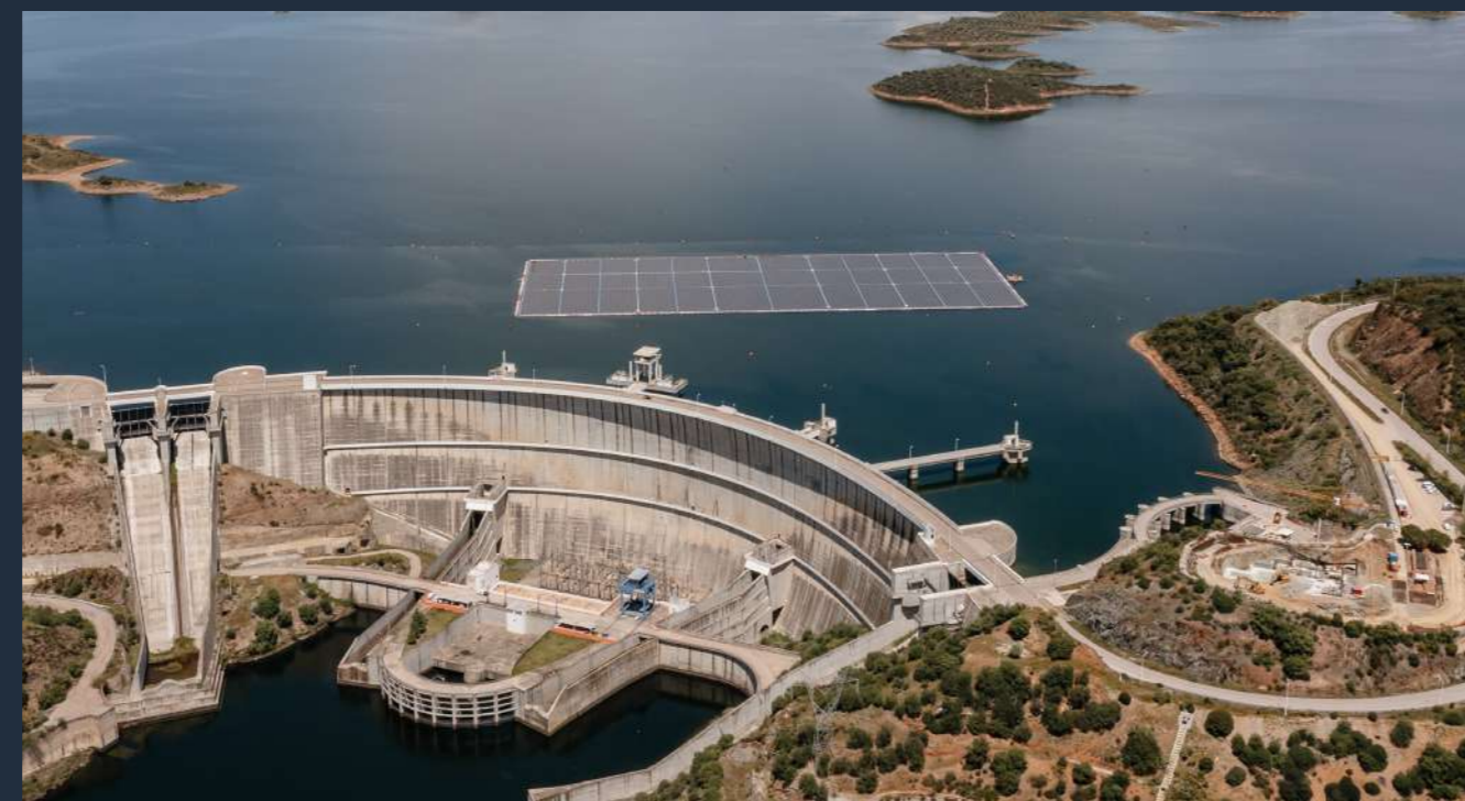
Alqueva, Portugal 葡萄牙阿尔克瓦

EDP 是葡萄牙的主要投资者，国家经济发展的引擎之一，同时也是该国最大的电力生产商、分销商和供应商。